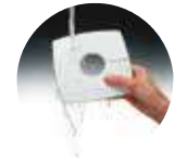
EASY-TO-CLEAN REMOVABLE COVER