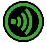
PIR: INFRA RED SENSOR ACTIVATED BY PRESENCE