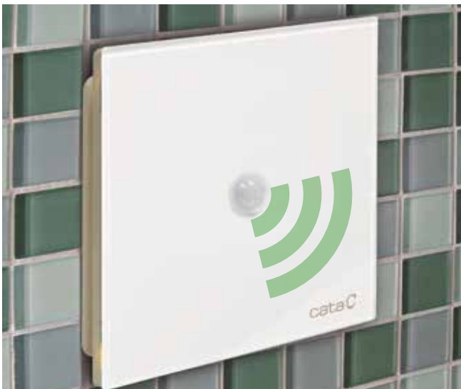
E-100 GLASS PIR - Infra red sensor, activated by presence